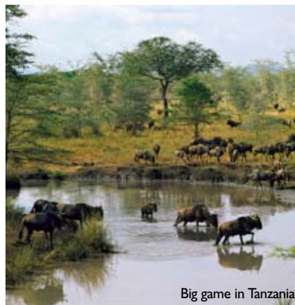
Big game in Tanzania